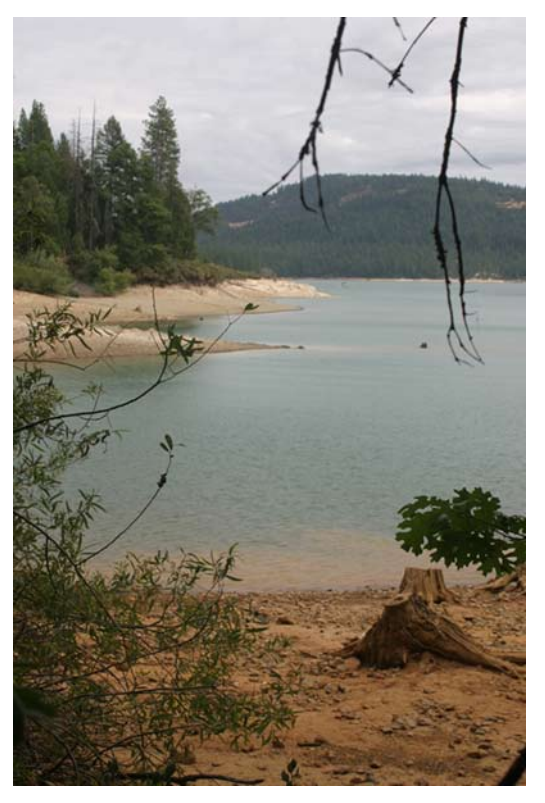
Scott's Flat view

There will be another planning meeting with PFLAG and UUCM volunteers on August 10th at 6:00 PM. All interested in the progress of this outreach partnership to help support our community's LGBTQ youth are welcome and encouraged to attend.