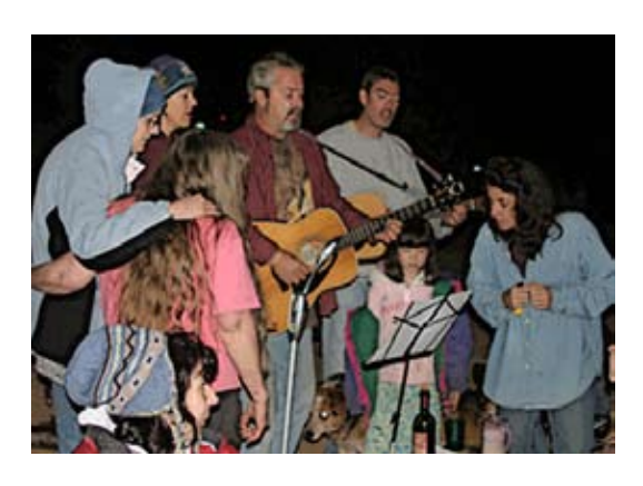
continued on page 10

FRIDAY AND SATURDAY CAMPFIRES with amazing music from our very own UUCM musicians. Bill Nolan has been collecting your song requests and is preparing an expanded UUCM Camp Song book for all of us to enjoy.