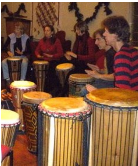
UUCM Drum Group