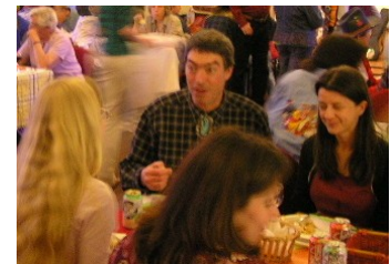
Congregational Dinner, 2010