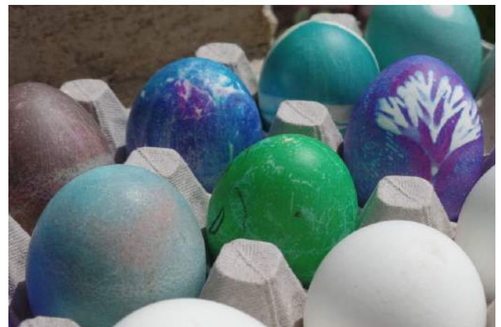
A few of the beautiful eggs decorated at the Easter Egg Dyeing Party at UUCM on Friday, April 19th. More photos on page 10.