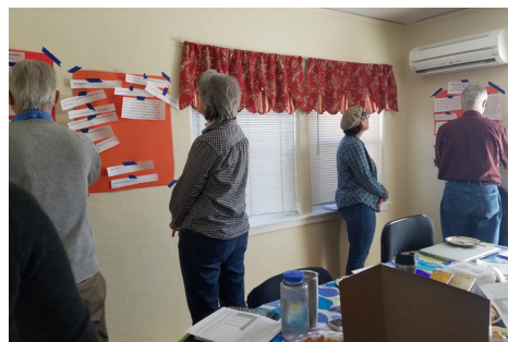
RE Visioning Team members exploring the "big questions"