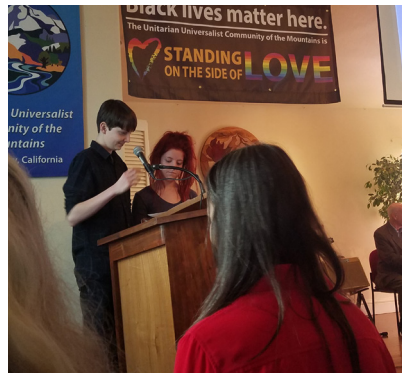
Teens take the podium at our February Full Community Service

It was a joy to explore what it means to be “love people” at our Full Community service in February. Our youth offered many ideas for this service and our future services – and we are so pleased to have time to explore together during these Full Community Services. Join us again on March 19!