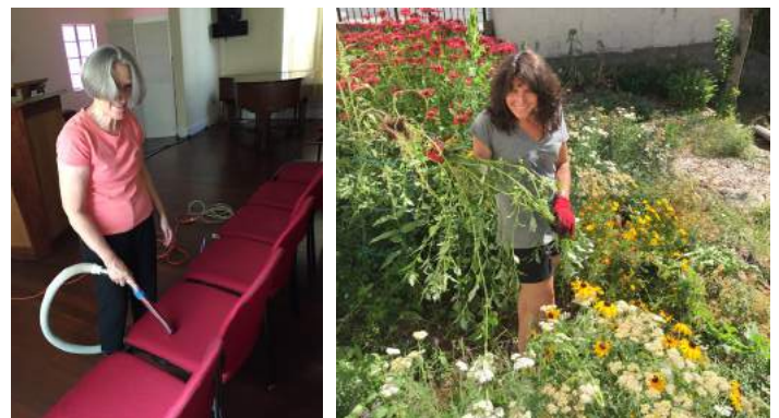
A couple of cheerful crew members from a past work day...

Lastly, I promise I am not a broken record, but the UUCM monthly work day is a wonderful opportunity to get your toes wet in volunteering at UUCM. This time of year, there is a lot of outdoor work that needs to be done. This month we barely made a dent in the outdoor projects. If you are willing to help at UUCM, but Saturday is not good a time for you, please let me know. I am sure we can find a project you could work on at another time.