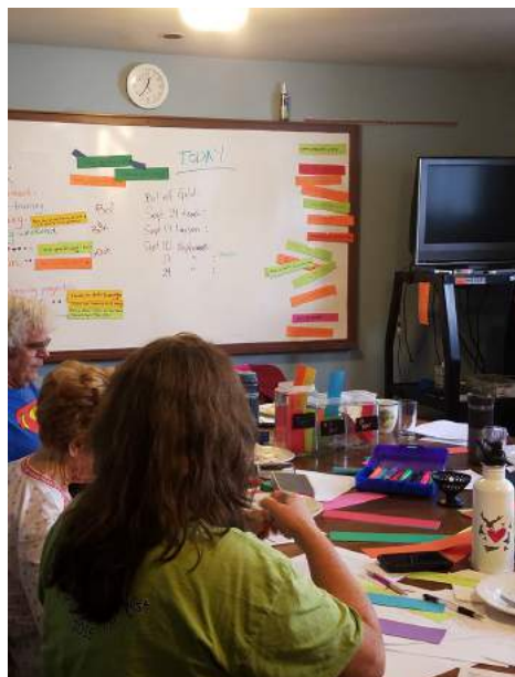
R.E. Visioning Team at work.