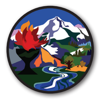
SAVE THE DATE:

UUCM ANNUAL CONGREGATIONAL MEETING MAY 31, 1 P.M. AT UUCM