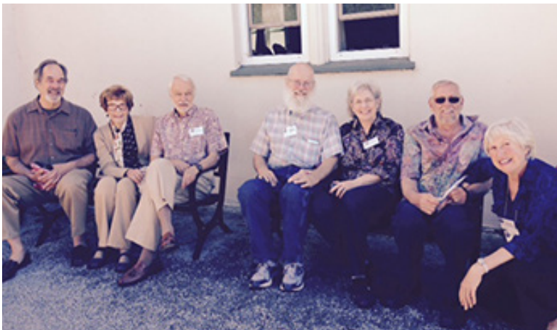
A few UUCM folks enjoy our new outdoor benches in the front of the church!

What a great day! Remember if you want to participate in keeping our building and grounds in good condition, we can use your help. We are always looking for volunteers on work party days. Come dip your toe in the water... It's a great way to make friends and contribute! The next scheduled work day is June 20th, 2015. Hope to see you there.