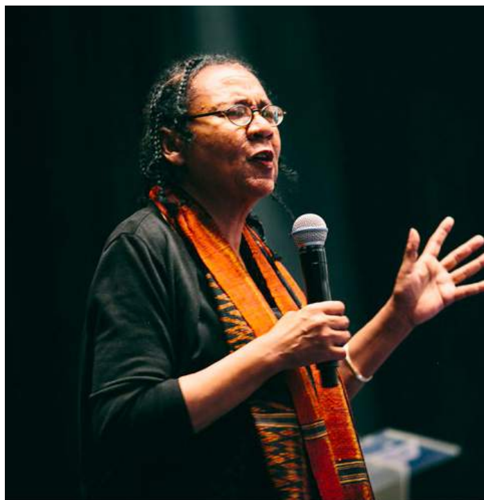
bell hooks, International Women's Convocation Keynote Speaker

Visit http://www.IntlWomensConvo.org for all details.