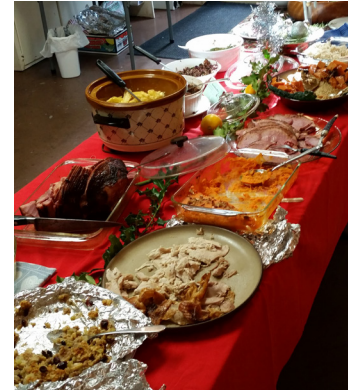
Ham, turkey, dressing, yams, and all the trimmings ↑