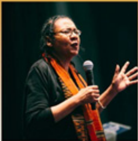
bell hooks, PhD Writer, professor, feminist theorist, activist