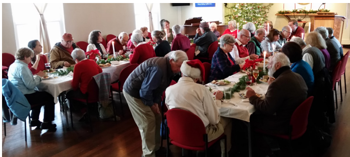
Christmas Day: All Dressed UP! ↓ Feasting ↑ Solstice Food! ↓