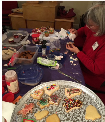
Decorating cookies! ↑