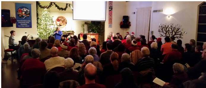
Over 100 people attended our Christmas Eve service! ↑