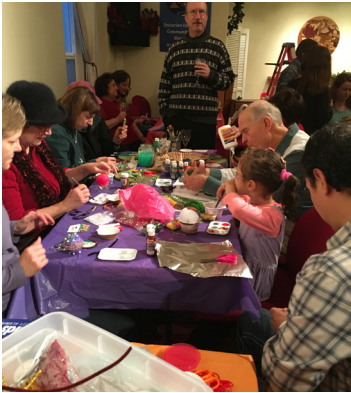
Crafting with friends ↑

We've been having fun together in December! Starting with our Holiday Party on December 10th when we decorated the tree with handmade ornaments, sang carols, decorated cookies and cupcakes and pot-lucked together, then our Yule/Solstice service, our candlelit Christmas Eve service and finally our Christmas Day Service followed by a Potluck Dinner – we've had a lot of opportunities to join together and share experiences. Please enjoy these photos of a few highlights.