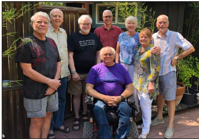
Our new UUCM Board at their August retreat.