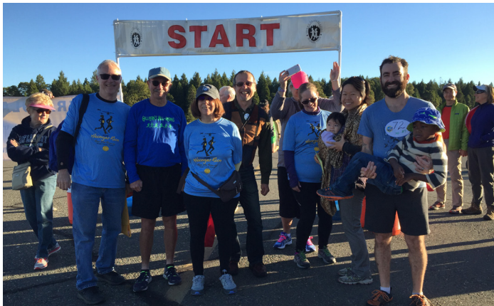
A few UUCM members who participated in the Interfaith Food Ministry (IFM) Hunger Run last month.