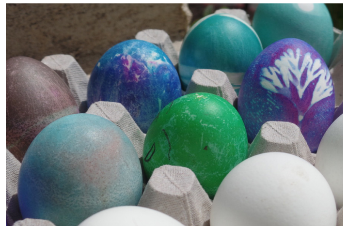
A few of the beautiful eggs decorated at the Easter Egg Dyeing Party at UUCM on Friday, April 19th. More photos on page 10.