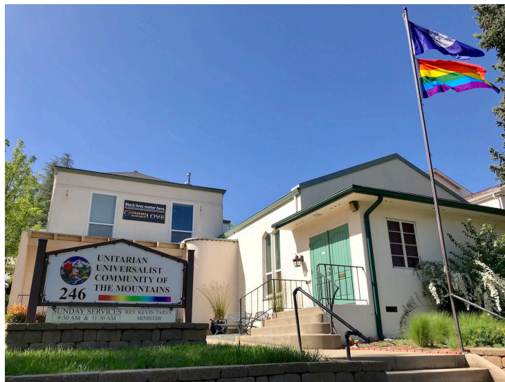
Photo of our beloved community's home