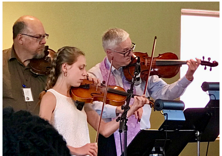
from our recent Music Service.