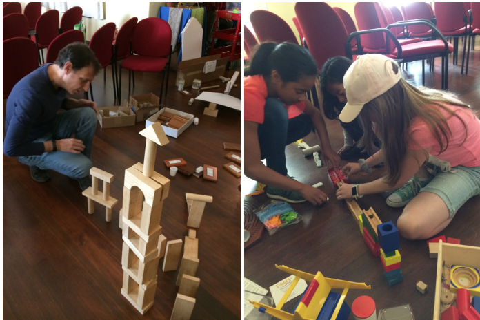
Kids of all ages enjoyed building Rube Goldberg machines!

You can see a video of our machine in action here: https://www.youtube.com/watch?v=XoyKSj6MdM&feature=youtu.be