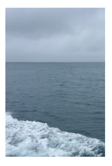
Page 4 of 15