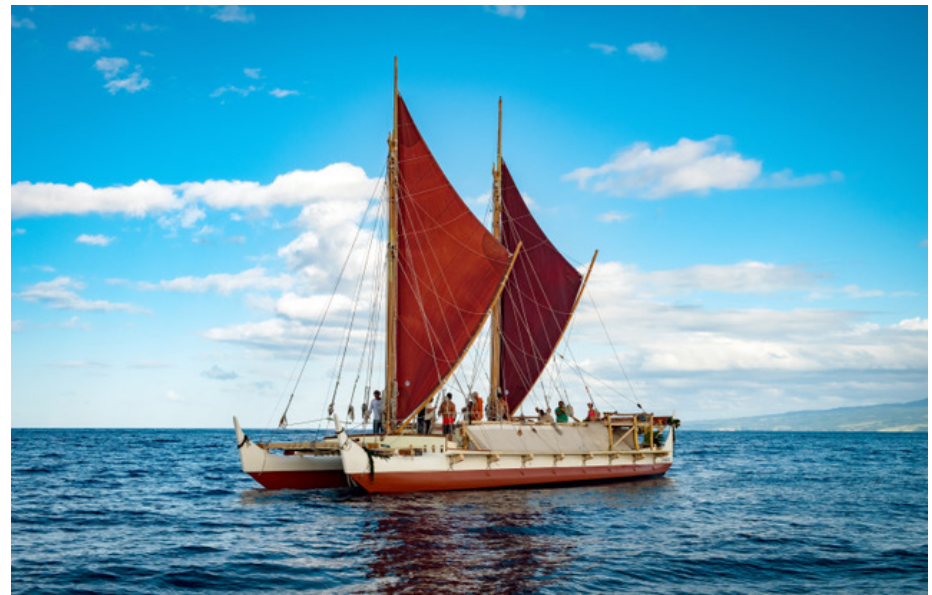
Hōkūle'a

In Hawai'i in 1975, the Polynesian Voyaging Society launched Hōkūle'a.