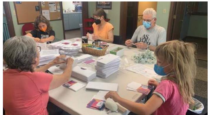
Everyone can help at a Vote For Our Lives Work Party!

Thank you for your compassion- and justice-centered generosity.